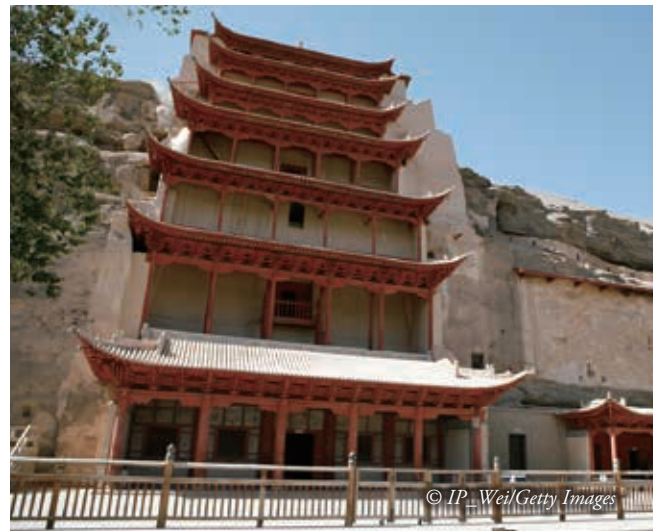
Dunhuang, in Western China, a key point on the Silk Road, home to hundreds of caves featuring early Buddhist art and statues

A grassroots movement in 192 countries and territories worldwide, the Soka Gakkai is dedicated to sharing the empowering message of the Lotus Sutra and Nichiren Buddhism in today's world.