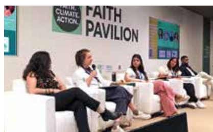
SGI-UK representative speaks on interfaith panel at COP28 in Dubai, UAE

These proposals give impetus and direction to the organization's grassroots efforts to tackle global problems and build the culture of peace.