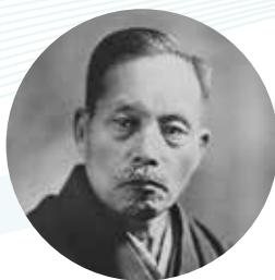
First President Tsunesaburo Makiguchi

Tsunesaburo Makiguchi (1871–1944) founded the forerunner to the Soka Gakkai, the Soka Kyoiku Gakkai (Society for Value-Creating Education), on November 18, 1930, together with his disciple Josei Toda, and served as the organization's first president. An educator and philosopher, Makiguchi was imprisoned during World War II for opposing the policies of Japan's militarist government and died in prison.