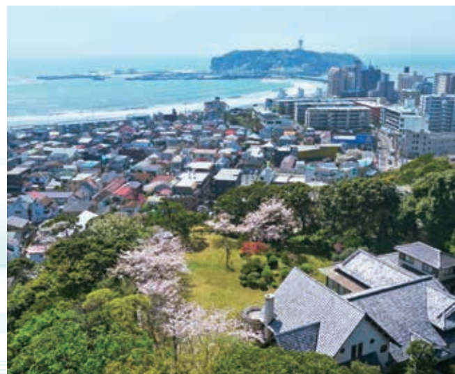
Kamakura, where, some 800 years ago, Nichiren lived and taught