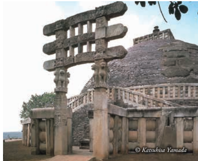
The Great Stupa at Sanchi, India, commissioned by the Buddhist emperor Ashoka in the third century BCE