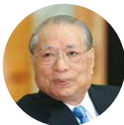
Third President Daisaku Ikeda

Josei Toda (1900–58), Makiguchi's disciple and a fellow educator, cofounded the Soka Gakkai and was imprisoned together with his mentor during the war. On his release from prison, he reestablished the Soka Gakkai and developed a membership of some 750,000 households throughout Japan by the time of his death. Toda was ardently opposed to war, and his 1957 Declaration Calling for the Abolition of Nuclear Weapons is seen as the starting point of the organization's peace movement.