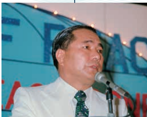
Daisaku Ikeda becomes third president of the Soka Gakkai and makes his first visit to members outside of Japan