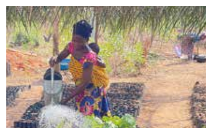
"Support for Women's Groups in the Restoration of Forest Landscapes in Togo," a joint project with ITTO