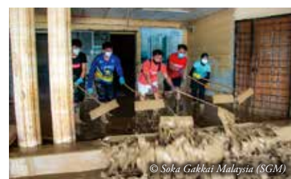
Soka Gakkai Malaysia members support their community after heavy floods