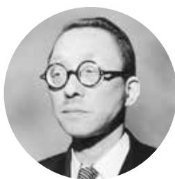
Second President Josei Toda

The first three presidents of the Soka Gakkai, Tsunesaburo Makiguchi, Josei Toda and Daisaku Ikeda, revived Nichiren Buddhism in the modern age and created the basis for its development as a globally accessible philosophy. Their shared commitment to this effort exemplifies the mentor-disciple relationship in Buddhism. They are respected as the founding presidents and mentors of the organization.