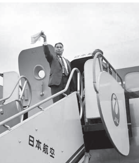
The Soka Gakkai International (SGI) is founded